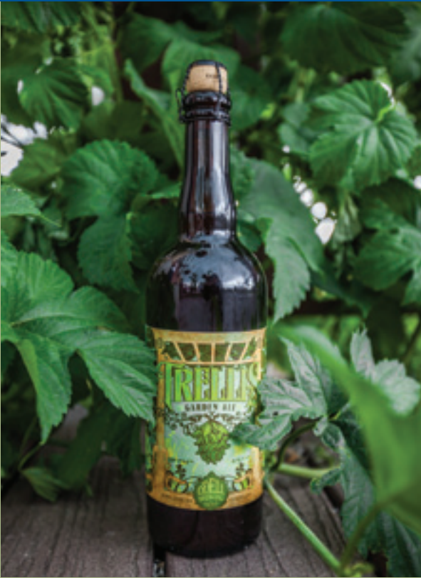
Trellis Garden Ale was brewed by Odell Brewing Company featuring coriander, cilantro, pineapple mint, lavender and rose petals grown at The Gardens. $1 from each bottle of Trellis Garden Ale sold will be donated to the Gardens on Spring Creek in 2015.

Lastly, The Gardens was honored to co-host the American Public Garden Association’s annual conference with our regional partner gardens—Denver Botanic Garden, Cheyenne Botanic Garden and Betty Fort Alpine Garden. It was exciting to show off our garden to colleagues from around the country.