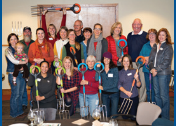
Each of our Plant it Forward Champions received a garden fork for all of their efforts.

The Gardens hosted five Garden Network meetings throughout 2014, with attendance more than doubling from 2013. Meetings were attended by a broad range of non-profit, health, service and community organizations, businesses, faculty, staff and students from CSU and Poudre School District, as well as gardeners and community members. The meetings provide opportunities to build partnerships, collaborations, network and share resources.